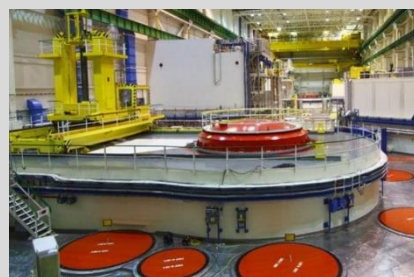
Figure 3 Reactor hall of Mochovce 3.

VVER unit in Mochovce (Slovakia) reached its first criticality on 22nd October 2022. The controlled fission chain reaction is already underway in the reactor, although the reactor power is still very close to zero. The power operation is expected at the beginning of next year. We wish all the best and long-term operation to the 3 rd Mochovce reactor!